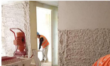
Xian in Shanxi Construction site