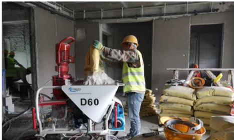
Jiangbei in Chongqing construction site